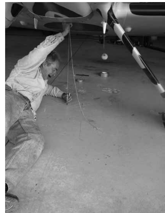
Top: Jack the gearleg up and spin the wheel to check trueness. If the bearings are loose, snug them up for the measuring. Left, Using a plumb bob mark centerline points on the floor. Note the tennis ball on the tip of the antenna.

After installing the new motor mount I began noticing rapid tire wear, burning off a set of tires in only 20 hours of circuits... thanks go to a local RAA member who suggested I check my wheel alignment