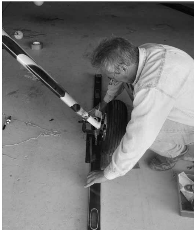
Left: Tape the string to the rearmost point and extend it forward, crossing the forward point. Below, left, sight down the rim or disc and set the straightedge on the floor. Below, measure the distance to the centerline at both ends of the straightedge. One inch difference over 5 ft is 1 degree.

With spring gear it is necessary to roll the plane back and forth to allow the gear to find its relaxed position. This is a pain and difficult to get it right and to get a repeatable measurement. An alternative is to use grease plates under each tire. I made mine from squares of .032" aluminum, pairing them with grease smeared between. With grease plates under the wheels the legs can displace easily and it is not necessary to