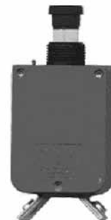
An Aviation Circuit Breaker

Aircraft circuit breakers are designed to interrupt the flow of electrical current when specific conditions are reached. Those conditions of time and current, generate heat. Circuit breakers are designed to trip (open the circuit) before this heat damages either wiring or connectors. A specification might be for a breaker to trip under a massive short jolt (e.g. 10 times the rated load of the circuit-